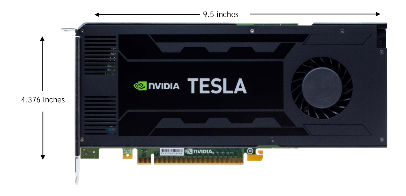
Figure 2. Tesla K8 GPU Active Accelerator

The Tesla K8 boards (Figure 2) conform to the PCI Express full height (4.376 inches by 9.5 inches) form factor.