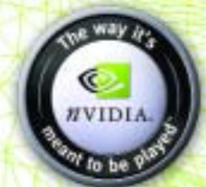
Command & Conquer Generals™/EA Games

Look for games displaying this logo for the best gaming experience.