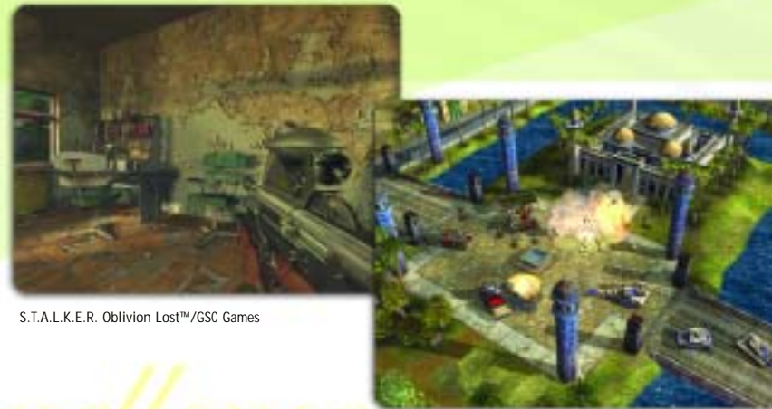
S.T.A.L.K.E.R. Oblivion Lost™/GSC Games