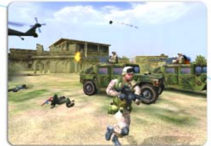
Delta Force®: Black Hawk Down™/NovaLogic

The NVIDIA GeForce FX family of GPUs leverages the industry-renowned NVIDIA Unified Driver Architecture (UDA), ensuring simple software installations and upgrades while consistently delivering the compatibility and reliability that you expect from NVIDIA. Continual driver performance and feature upgrades ensure forward compatibility with yet to be released software applications and APIs for long-term stability. In addition to using the most solid driver architecture, the NVIDIA GeForce FX GPUs carry on the NVIDIA commitment to deliver the most complete software feature set. NVIDIA nView™ multi-display technology offers a comprehensive solution for multi-monitor support, increasing screen real estate for more efficient viewing and switching between multiple active windows. NVIDIA Digital Vibrance Control™ (DVC) technology provides increased levels of adjustment for richer colors and brighter, cleaner, and consistent images and text under any lighting conditions.